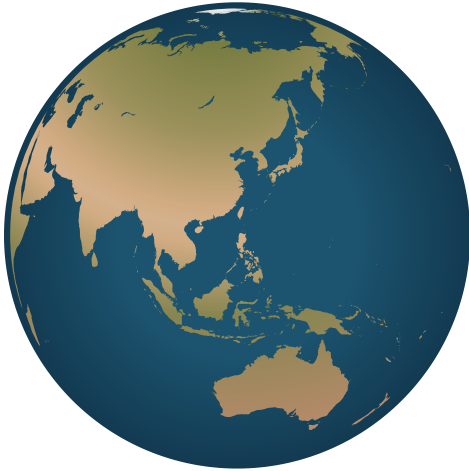
Plate Tectonic Project